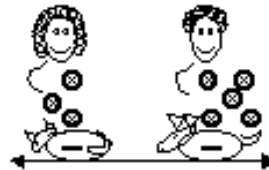
Multiplication Table (MT)