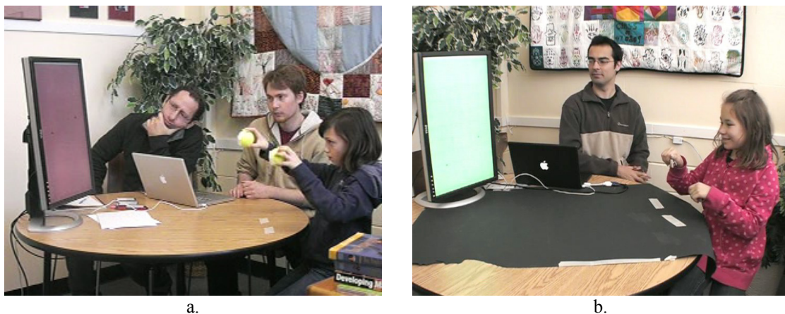
Figure 2. MIT in action: (a) a student's "incorrect" performance (raising both hands up away from a previous "green spot" at equal increments, i.e. fixed distance) turns the screen red; (b) "correct" performance (raising both hands up away from green at proportionate increments, i.e. different distances) keeps the screen green.

The MIT measures the height of the users' hands above the desk. When these heights (e.g., 10" & 20") match the unknown ratio set on the interviewer's console (e.g., 1:2), the screen is green. So if the user then raises her hands in front of this "What's-my-rule?" phenomenon by proportionate increments (e.g., to 15" & 30"), the screen will remain green but will otherwise turn red (e.g., to 15" & 25"); note that this pair of heights is 5" higher than both the left and right hands, respectively, in the 10" & 20" case). Study participants were initially