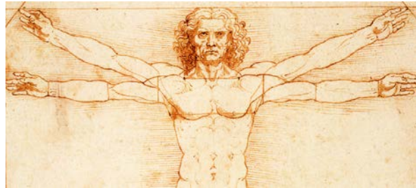
Figure 3. Instructional use of the “balance beam scale” metaphor in algebra (mathematics) juxtaposed with a fragment from da Vinci’s Vitruvian Man as illustration for the intended embodiment of balance images.

From the ecological-dynamics perspective, the phenomenon of metaphorical visualization and engagement is conceptualized as a system composed of an organism (the algebra novice), a task (“solving for x ,” i.e. the task of determining the numerical value of the variable), and an environment (the manifold ecology in which the organism is to complete the task). Algebra novices are viewed as impeded by contextually inappropriate environmental constraints that they themselves are projecting into the field of action, namely the operational visualization. That is, students’ robust arithmetic coordination patterns pre-constrain them to engage and manipulate features of the visual display in ways that block their access to a critical task-relevant affordance of the algebraic equation. The instructor who discerns behavioral evidence of the student applying these less effective constraints intervenes by offering alternative environmental constraints, and specifically by augmenting the algebraic proposition with the balance-beam structural dynamics (see Figure 3).