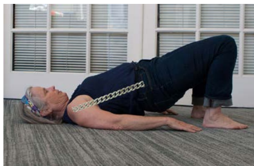
Figure 4. ‘Spine like a chain’ (illustration picture with superimposed image of a chain).

A common problem in human movement is how to enhance the efficient, comfortable, and safe use of the spine. This is not just a question of anatomy and physiology alone, as human movement is learned from infancy in the context of the community’s “form of life” for the individual (e.g., task demands, socio-cultural practices, the material-cultural environment; Rietveld & Kiverstein, 2014, p. 327). The most efficient movement of the spine involves the distribution of force and movement through the spine according to its overall shape, the structure of the vertebrae, and their relationships.