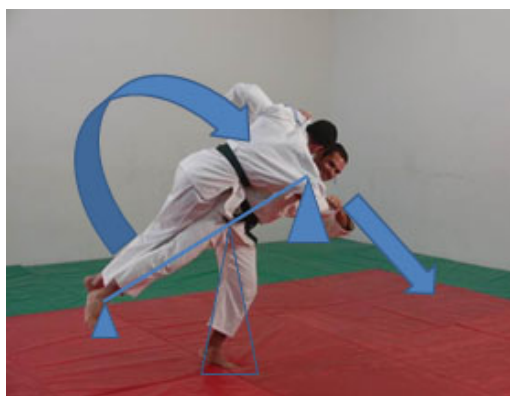
Figure 2. Instructional use of the “balance beam scale” metaphor in judo (sport)